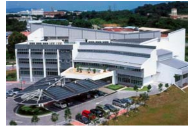
Pusat Tenaga Malaysia's ZEO Building, Malaysia