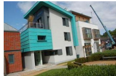
The Barratt Green House in Watford, UK