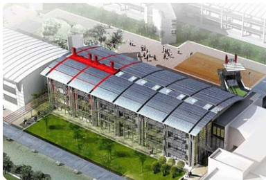
BCA Academy, Singapore