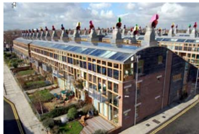
Beddington Zero Energy Development (BedZED), London