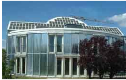
Self-sufficient solar house, Freiburg, Germany